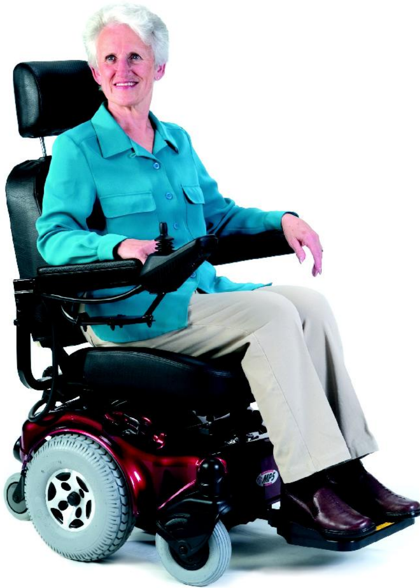
MP5 Base Powerful Mid Wheel Drive Type 3